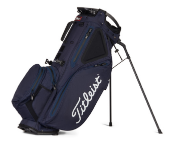
HYBRID 14 STADRY™