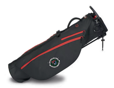
PREMIUM CARRY BAG