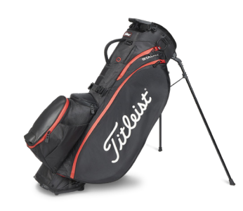
PLAYERS 5 STADRY™