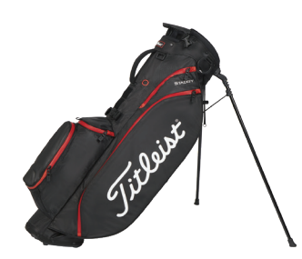
PLAYERS 4 STADRY™