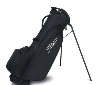
PLAYERS 4 CARBON