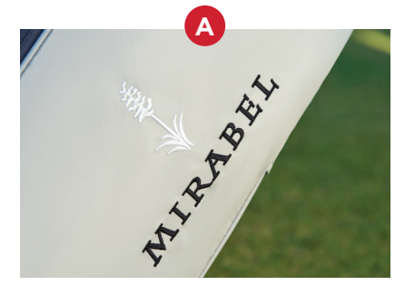
Embroidered Logo Only